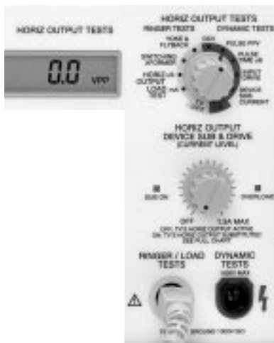
Fig. 1: Controls used to perform the HORIZ OUTPUT TESTS.

The following outline presents an overview of the recommended procedure